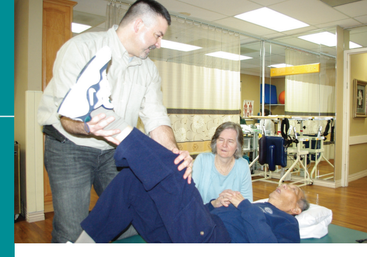
"where therapists learn and excel in the care of the ever-increasing older adult population"

Rehabilitation Strategies for the Older Adult with Multi-Morbidity