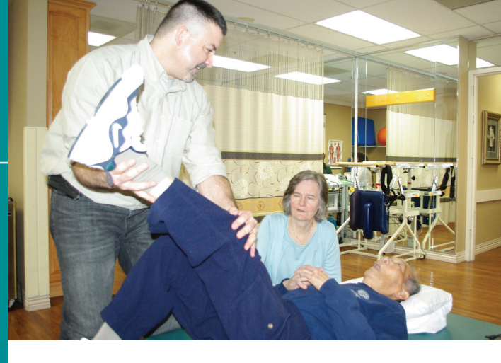
"where therapists learn and excel in the care of the ever-increasing older adult population"